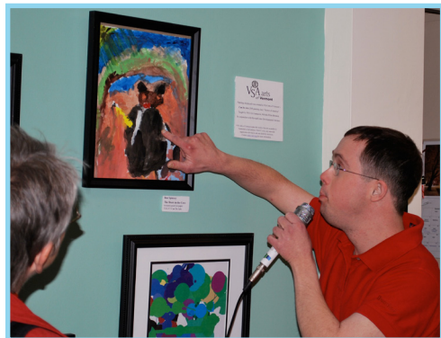
A Vermont artist describes his work at the CDCI Art Gallery