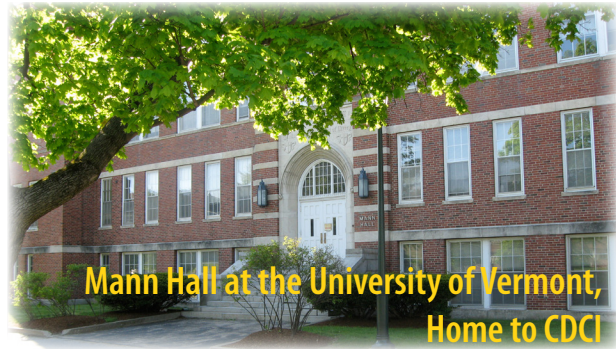
Mann Hall at the University of Vermont, Home to CDCI

CDCI operated 27 projects this year, enhancing services for people with disabilities and their families, from early childhood through adulthood.