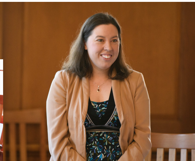
Every year, CDCI affiliates present research findings at the College of Education and Social Service’s Scholarship Symposium (left photo).